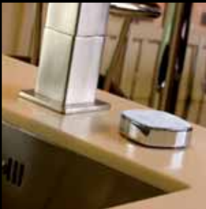
alternative installation positions

Installation is quick and simple. Abode has pioneered the use of pushfit technology for the simple DIY installation of our kitchen taps and utilise the same technology with the SWICH filter water.