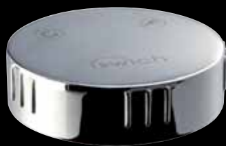
Circular AT1162 Chrome AT1163 Brushed Nickel AT1164 Antique Bronze

The SWITCH handle is available in two designs, to coordinate with all styles of kitchen taps, so that it blends into your overall sink and kitchen scheme. It is also available in a number of popular finishes to coordinate perfectly with your other kitchen appliances.