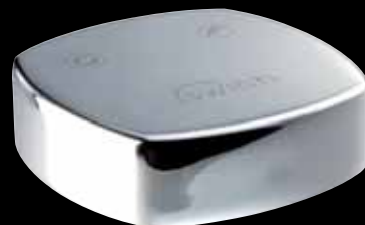
Square AT1165 Chrome AT1166 Brushed Nickel